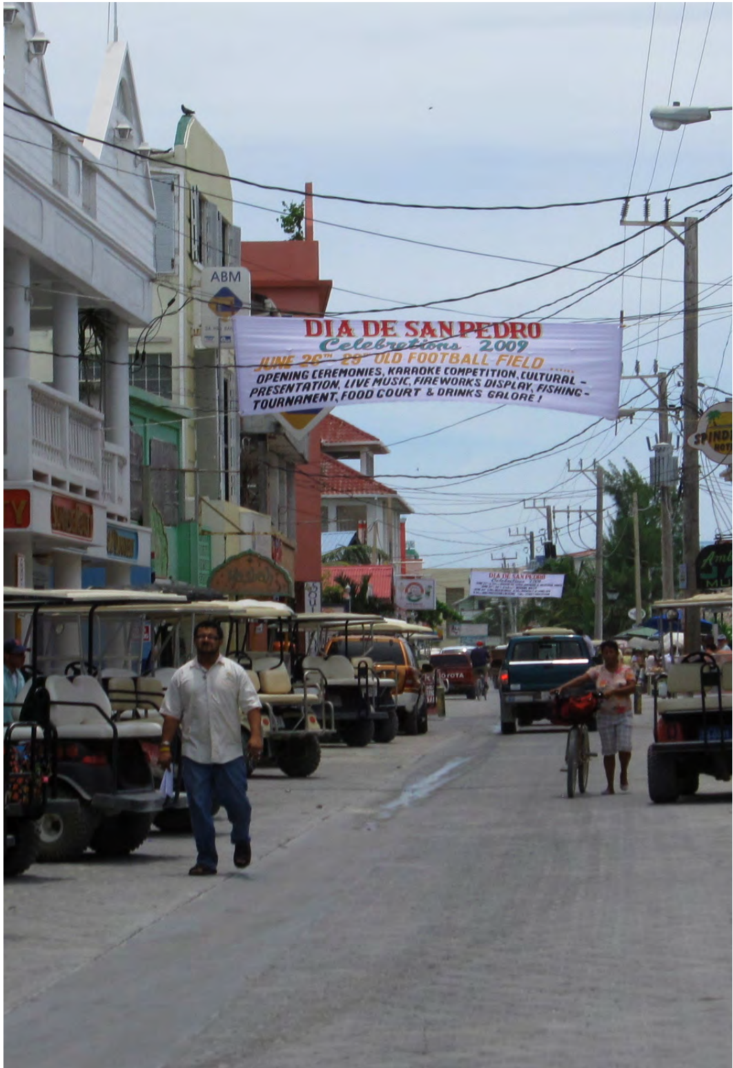
Part of Barrier Reef Drive in San Pedro