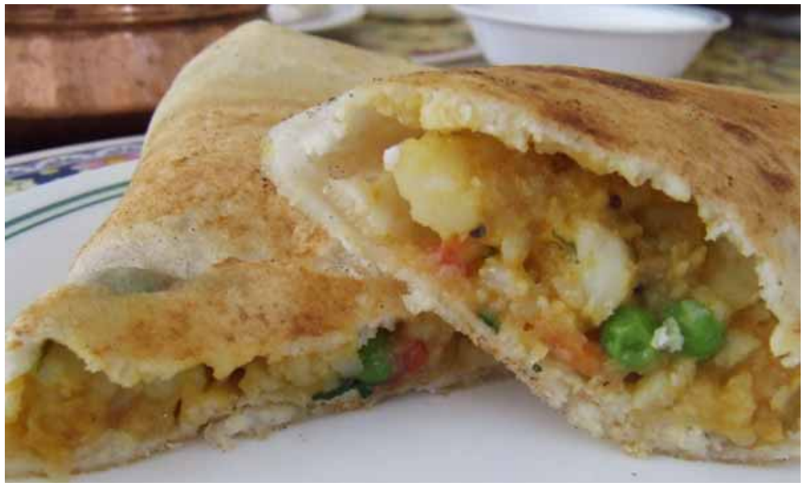
A traditional Indian Sunday dish is prepared weekly at Sumathi.

ways fresh, never utilizing frozen or canned prepared goods; Indian cuisine is also known for its low fat dishes which are superbly healthy and delicious. Cooked in the Tandoori, meats are cooked against the wall of the oven