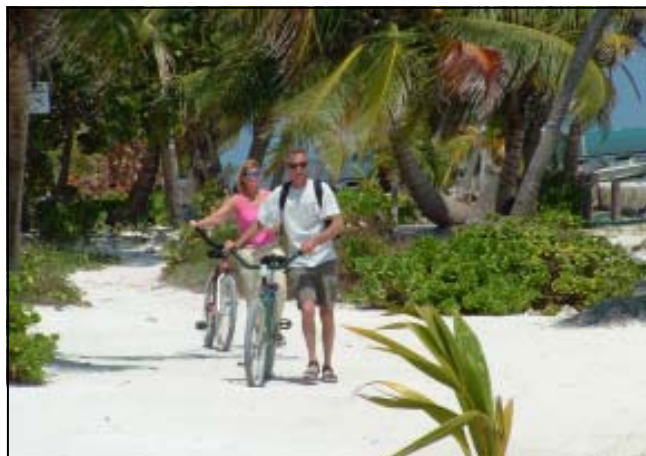
San Pedro's beaches and roads are great for bike riding, but be prepared to walk through some of the deep sand.

New 2 bedroom, 2 bathroom Half-acre lot in Retirement Village Mahogany cabinets throughout Semi-furnished Seller financing available Call 226-3464 or 605-6503 $155,000 US