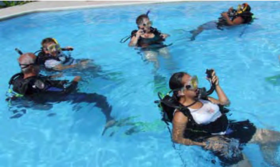
Despite lead belts around our waists and a heavy tank strapped to our backs, we discover that our BCD can in fact keep us afloat with ease!

to remain weightless, “so you can swim effortlessly and move freely in all directions.” It is important how your equipment works in helping you achieve neutral buoyancy. Part of your equipment will include using a buoyancy control device (BCD) which when inflated will allow you to float and when deflated will make you sink, just enough air on it will help you be “weightless.” Pressure is an un-denied factor to each and every diver. “Just as air ex-