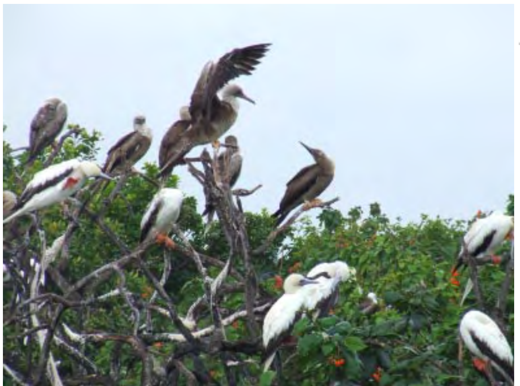
From a treetop tower, you can get a rare "bird's eye" view of a Red Footed Booby rookery.