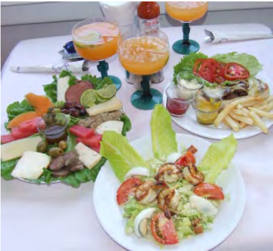
The Antipasto Plate, Italian Sandwich and Caesar Salad with shrimp welcome you back to Sweet Basil.

Located just across the river cut, Sweet Basil is only a hop, skip and a jump away. And once you know what you are in for (tasty delights), you can