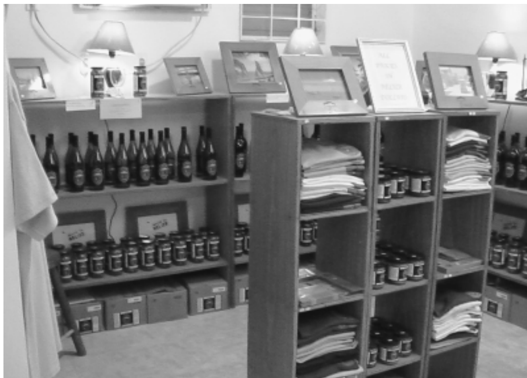
Fully stocked shelves house delectable olives, smooth California wines and gourmet olive spreads.