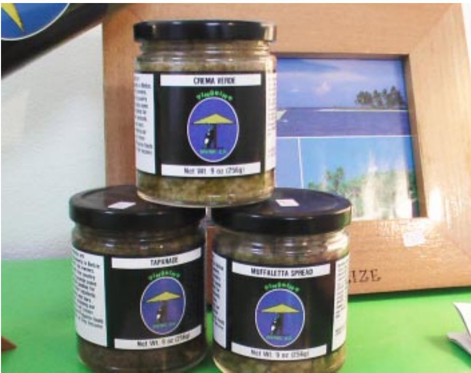
The olive spreads are the perfect topping for breads, crackers or cheeses. Also pictured above are the many items available at Pinguino as a souvenir - wooden frames, cheese boards, wine balancer, wine glasses and more!