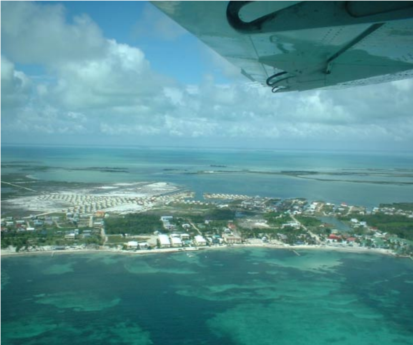
Ambergris Caye isn't a large island. It is 25 miles long and only four miles wide at its widest point. Much of the island is low mangrove swamp, and there are a dozen lagoons.