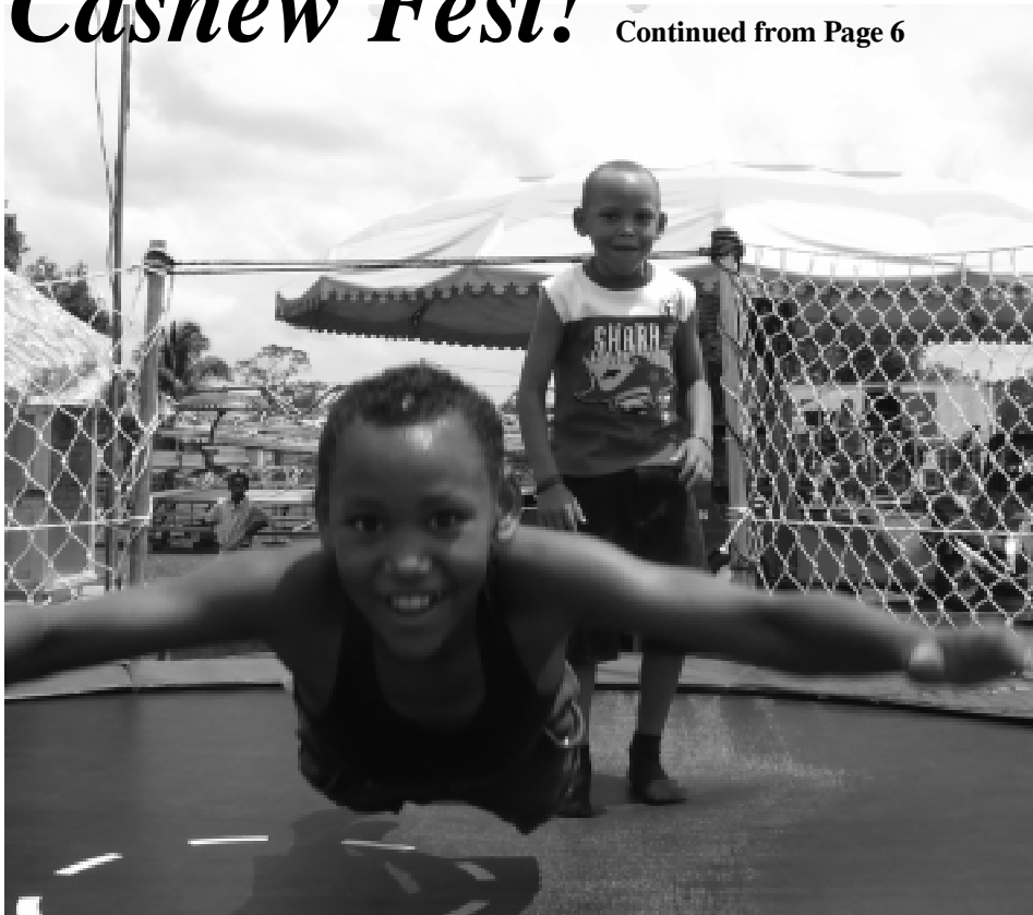
Part of the fun of Cashew Fest was the activities available for the children. Here some happy boys enjoy bouncing around on the trampoline.