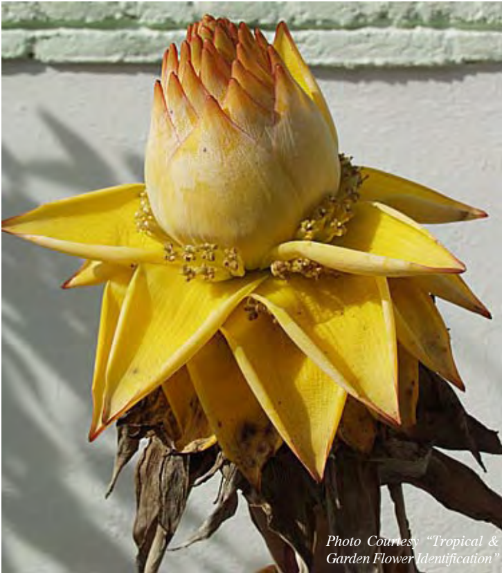
The exotic looking Golden Lotus Flower actually belongs to the Banana family.

and then later as a photo-pro with the Aggressor Fleet on the original Belize Aggressor. When asked what his most memorable Belizean experience is, Graeme is quick to answer, "That's easy, first discovering Lighthouse Reef which back in the 1980's was remote, tranquil, movie island perfect and peaceful as one could possible experience on planet earth. The beauty was breath taking." Graeme's first visits to Belize were all about underwater photography and he reminisces, "It was all about shooting underwater in those days but the images of perfect white sand beaches, perfect turquoise waters and perfect palm trees stands out to this day. In fact, every time I see that Corona beer commercial at Christmas with the palm trees and one lights up with Christmas lights – it always says Belize to me." Now residing in Adel, Georgia, USA, Graeme runs several companies including GTPhoto, which is a world wide marine stock agency where he markets the work of some 25 photographers. He has also built a Georgia stock agency and just finished shooting and sup-