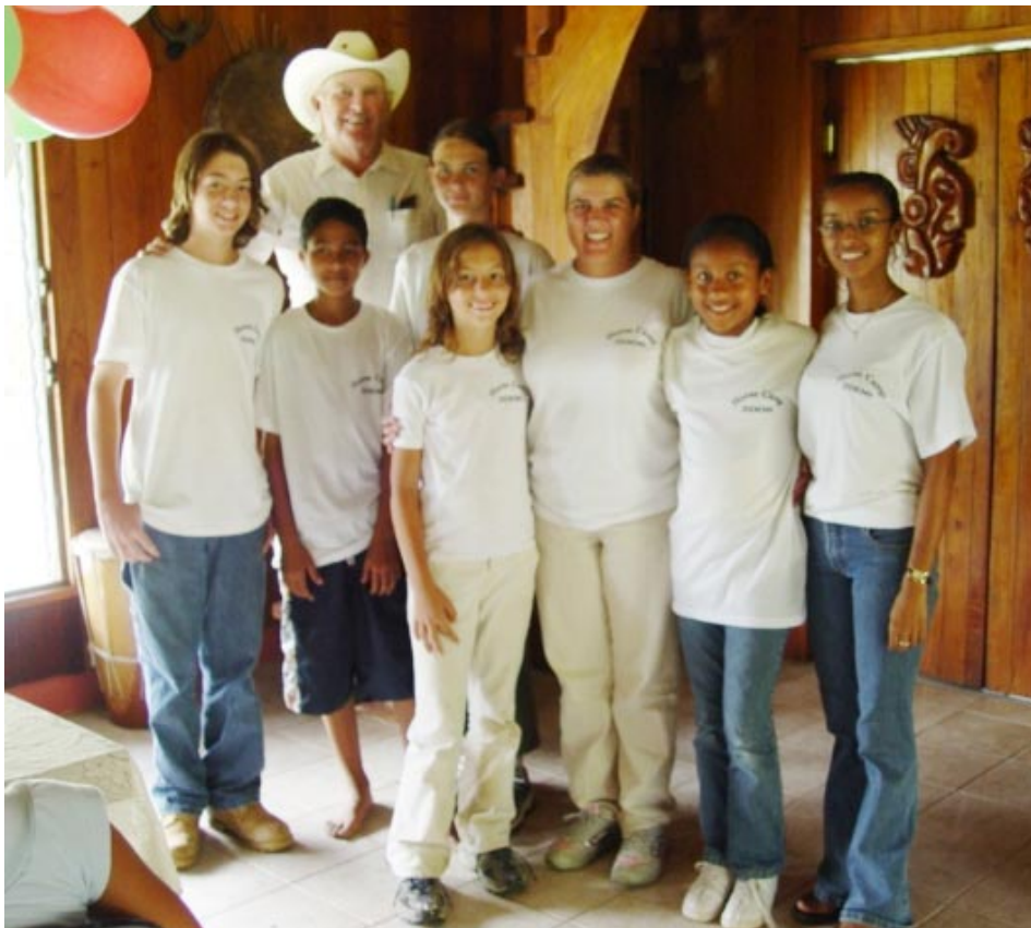
Campers get to make new friends, bond with the horses, and ultimately, enjoy a week of fun activities that offer them a glimpse of the different side of Belize.