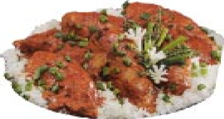
Paprika and cream make for a hearty and satisfying dish.

and oil over medium heat. Cover and cook for 5-7 minutes or until juices run clear. Remove chicken: keep warm.